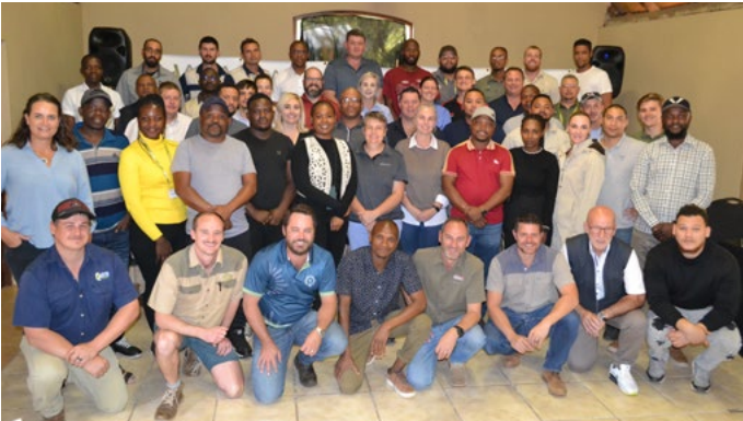
The AFMA 2024 Feed Miller Short Course, held at The Conclave Country Lodge, brought together a diverse group of 52 delegates from South Africa, Zimbabwe, Cameroon, and Saudi Arabia.