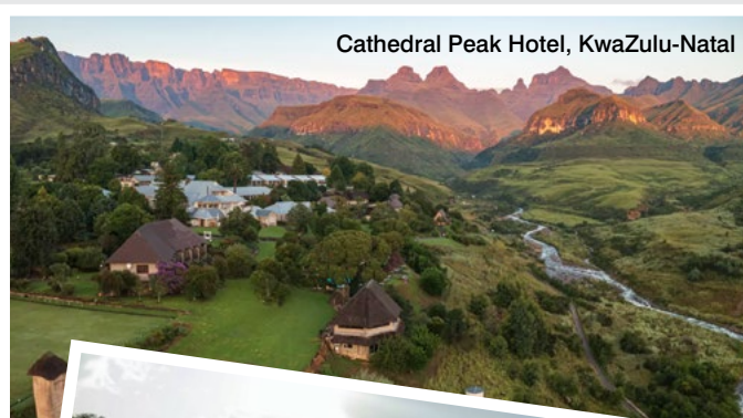
Cathedral Peak Hotel, KwaZulu-Natal